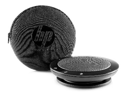
HP UC Speaker Phone